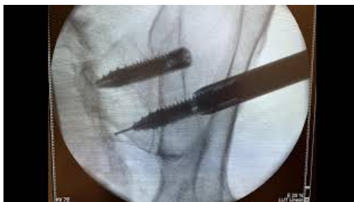
VIDEO 1: Video showing fluoroscopy steps and markings

Video 1 shows the percutaneous lateral-oblique surgical technique.