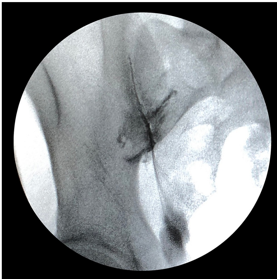
FIGURE 2: Diagnostic fluoroscopy demonstrating SIJ contrast test