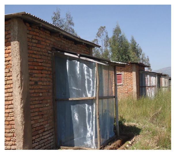
Figure 1. Experimental hut design of the study.

materials from which the tukuls made were described elsewhere.<sup>8</sup> The slits were constructed from pieces of metal shutters, fixed at an angle of 45° to create a funnel of 1 cm between slits. The design of window slit allows the inward flight of mosquitoes coming from filed but it will be hardly possible for them to escape once they entered the hut. A veranda trap made of iron mesh (22 mm diameter) was set at the back of each hut for trapping exophilic mosquitoes (Figure 1). It is presumed that some mosquitoes (inherently exophilic or mosquitoes repelled due to the exitorepellency effect of the chemicals impregnated into LLINs) will exit the hut once they enter and then after feeding on their host of choice. Thus, the verenda trap was designed to trap and quantify the proportion of mosquitoes exit the experimental hut and by virtue the efficacy of LLINs under test for its exito-repellent effect. Each night mosquitoes were allowed to enter into the hut via the window slits from the environment and freely move between the room and the verenda trap.