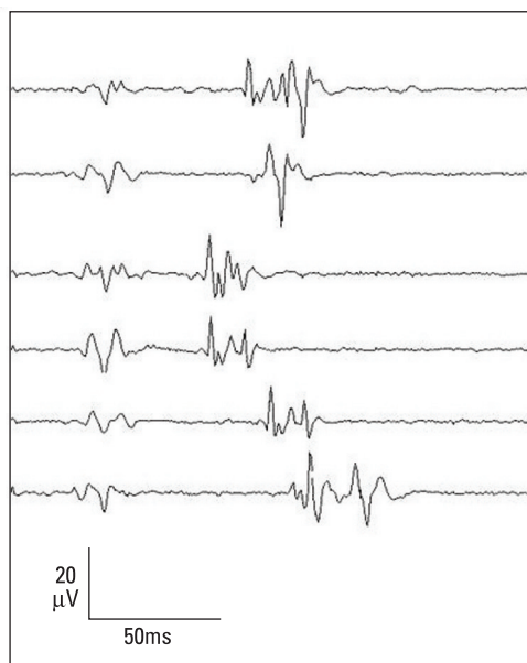
Fig. 2 Presence of R2 at 0.5 MAC. Late response (R2) was detected at lowest level of anesthesia in one experimental animal.

also appears to support the notion that a facilitated adductor reflex is likely responsible for a crossed R1 in the awoken state, whereas its sensitivity to pharmacologic sedation would imply that relevant facilitatory mechanisms are located central to motor neurons of nucleus ambiguus. 22