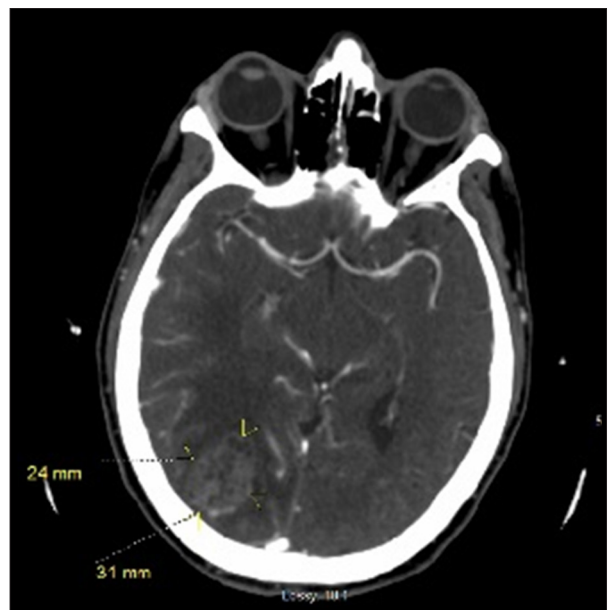
Figure 2. MRI of brain with contrast October 9, 2018. There has been significant interval increase in the size of a second heterogenous enhancing mass located in the right occipital lobe that currently measures 3.1×2.4×2.6 cm versus 0.8×0.5×1.3 cm on the prior study. There is extensive accompanying vasogenic edema surrounding this lesion.

decrement in the size of his neck mass; however, repeat CT chest with contrast status post chemoradiation revealed enlarging intrapulmonary metastases with mediastinal lymphadenopathy indicative of progression of disease (Figure 1). CT brain without