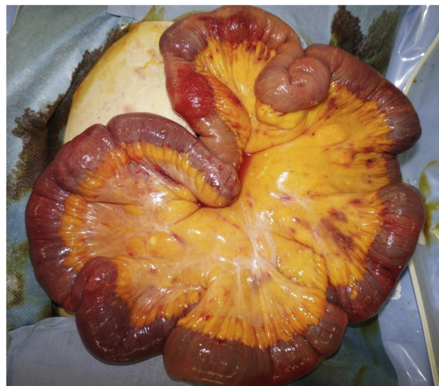
Fig. 3. Intraoperative findings at the second laparotomy, 38 h after Intensive Care Unit admission. Extensive segmental ischemia is observed.