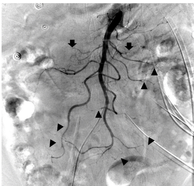
Fig. 2. Superior mesenteric arteriography. Superior mesenteric arteriography shows discontinuous flow (arrow) with multiple areas of stenosis (arrow heads).

However, the patient developed fever and right lower quadrant abdominal pain two days following ICU discharge. A third laparotomy was performed, and ileal necrosis was found 20 cm proximal to the ileocecal valve, requiring resection and ileostomy. Postoperatively, the patient was admitted to the ICU for continuous intra-arterial infusion of alprostadil for another 48 h. The patient was discharged to a chronic care facility 62 days after the original operation.