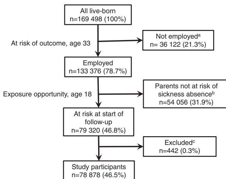
Figure 1 Flow diagram of live-born persons in Norway, 1974–1976. a Persons who died ( n = 4330 ; 2.6 %) or emigrated ( n = 11\ 826 ; 7.0 %) before age 33 years, or were not employed at age 33 years ( n = 19\ 966 ; 11.8 %). b Excluded because one or both parents were not considered to be at risk of sickness absence at index person age 18 years (1992, 1993, or 1994). In categories that were not mutually exclusive: 21.5 % ( n = 28\ 692 ) were excluded because their mother either received disability pension ( n = 8585 ; 6.4 %), emigrated ( n = 269 ; 0.2 %), was deceased ( n = 1478 ; 1.1 %), was a government employee ( n = 9252 ; 6.9 %), or had no income ( n = 16\ 119 ; 12.1 %). A total of 26.8 % ( n = 35\ 744 ) were excluded because their father either was not identified in the Medical Birth Registry of Norway ( n = 12\ 514 ; 9.4 %), received disability pension ( n = 6282 ; 4.7 %), emigrated ( n = 269 ; 0.2 %), was deceased ( n = 3376 ; 2.5 %), was a government employee ( n = 11\ 107 ; 8.3 %), or had no income ( n = 9325 ; 7.0 %). c Excluded because they received disability pension, emigrated, or died during the year of follow-up (2007, 2008, or 2009; age 33 years)

Primary Care (ICPC) diagnostic code [38]. Spells occurring during the calendar year of the participant's 33 rd birthday were included. All persons with sickness absence that fulfilled the duration criterion were classified in dichotomous ever-never categories: all-cause absence, pregnancy-related diagnoses (ICPC W), musculoskeletal diagnoses (ICPC L), psychiatric diagnoses (ICPC P), and all with absence(s) who did not receive a registered diagnosis during follow-up. Back disorders (ICPC L02, L03, L84, L86) and depression (ICPC P03, P76) were also considered. We further identified women with sickness absence(s) other than pregnancy-related as a specific outcome category.