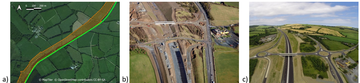
Fig 1. Road construction phases. a) ‘Before’—satellite image of part of the study area before road construction. The hatched orange area indicates the location of the M11 motorway construction zone adjacent to the N11 road. The N11 is represented by the green line. b) ‘During’—aerial photograph of part of the study area taken during road construction revealing the extent of the change to the habitat. The N11 can be seen to the right-hand side of the photograph. c) ‘After’—aerial photograph of part of the study area taken upon completion of road construction. The motorway and access roads were completely enclosed in continuous badger-proof fencing.

https://doi.org/10.1371/journal.pone.0242586.g001