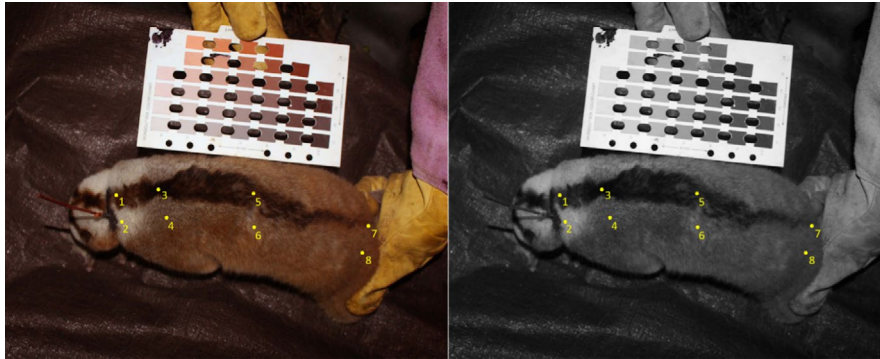
FIGURE 1 The color image (left) shows an image before conversion and analysis in ImageJ; the monochrome image (right) shows point selection for analysis, where 1 = dorsal stripe neck, 2 = nondorsal stripe neck, 3 = dorsal stripe cervical, 4 = nondorsal stripe cervical, 5 = dorsal stripe thoracic, 6 = nondorsal stripe thoracic, 7 = dorsal stripe lumbar, and 8 = nondorsal stripe lumbar regions. Contrast ratios were calculated between each dorsal stripe region and its corresponding nondorsal stripe region

of observation as a response variable (this ranged from 0 to 9). We included the individual as a random term.