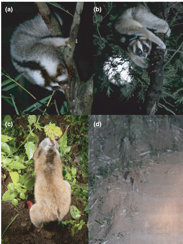
FIGURE 4 Javan slow lorises in West Java, Indonesia, demonstrating: (a) the high contrasting dorsal stripe of a juvenile feeding on an open trunk; (b) an adult female feeding on an open trunk; (c) an adult female moving on the ground; (d) an adult male on a recently cleared field

register a prone loris' dorsal stripe as the body of a dangerous snake. Qualitatively, the body color of slow lorises can match the color of the ground, potentially making the stripe potentially more visible (Figure 4d). While predation on slow lorises is rarely observed, hawk eagles ( Nisaetus spp.), orang-utans ( Pongo spp.), monitor lizards ( Varanus spp.), and pythons ( Python spp.) have all been recorded as predators (Nekaris et al., 2007, 2019). A loris is very visible in open terrain (Figure 4) but must go to the ground in times when habitat is not continuous. Furthermore, lorises regularly enter torpor in the cool dry season and reduce their activity overall. Exhibiting a higher pattern of color disruption could allow them safer and greater access to resources in the period when they are more active.