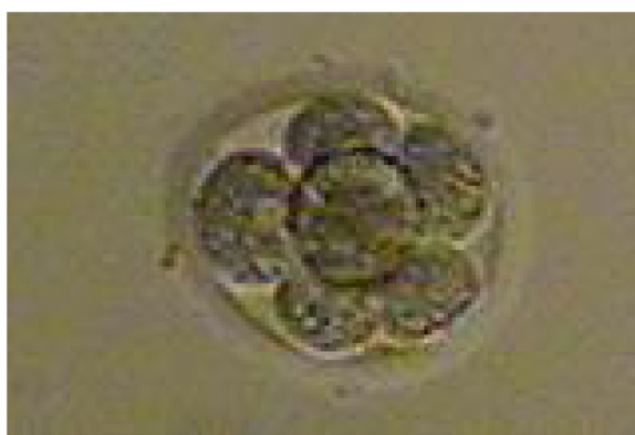
Figure 3 Enlarged Perivitelline space oocyte and corresponding day 3 embryo.

all subjects. Ovarian follicular development was monitored by transvaginal sonography and serial E2 levels. Once oocytes reached 18 mm or more in maximum diameter as viewed by sonography, 10,000 IU of hCG was administered. Thirty-five hours after hCG administration, oocytes were retrieved transvaginally under ultrasound guidance. Insemination was performed approximately 4 hours after retrieval using either 50,000 motile sperm per oocyte or intracytoplasmic sperm injection (ICSI) in the case of male factor infertility or, occasionally, oocyte factors. Prior to insemination, the oocytes were viewed under light microscopy and any abnormal morphology characteristic noted and photographs taken. Human tubal fluid (HTF) (Irvine Scientific, Irvine, CA) with 15% synthetic serum substitute (SSS) was used for embryo culture. The presence of two pronuclei (2PN) 20 hours after insemination confirmed fertilization. On day 3 after fertilization the embryos were analyzed for embryo grade, cell number, and percent fragmentation. Embryo transfer was performed day 3 vs. day 5 based on number of fertilized embryos and embryo grading. Serum beta hCG levels were drawn on days 12 and 14 after transfer. Clinical pregnancy was determined by the presence of a gestational sac by transvaginal sonography 19 or 20 days after transfer. Biochemical, nonclinical pregnancies were