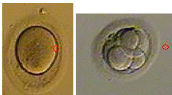
Figure 1 Oval shaped ZP oocyte and embryo.

136 IVF cycles from 119 subjects under 42 years old were identified where a majority (over 50% of oocytes) per cycle displayed one or more extracytoplasmic ZP abnormality (Figures 1, 2 and 3). Over the same time a matched control group for age of 77 cycles of 77 subjects in which all the oocyte ZP morphology was normal were selected as controls. The controls were carefully matched for age and time period of IVF to the cases to reduce confounding. One to one matching was performed for each case of dysmorphic oocyte to a