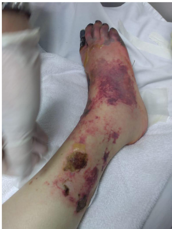
Figure 2 – Ischemic right lower limb with necrotic areas in the toe.

During the recovery period of her organ failures, the patient required surgical procedures including tracheostomy, debridement of necrotic areas in the right foot (Figure 2) and transtibial amputation of the left lower limb. Before those procedures, fondaparinux was ceased for 24 h and 72 h, respectively, and she experienced clinically relevant non major bleeding (CRNMB) with the need of blood products (red blood cells (RBC) and platelet transfusion) and reoperation for hemostasis at the tracheostomy site. Her hemodynamic improvement enabled CRRT to be transitioned to intermittent hemodialysis (IHD) on day 32, and this was accompanied by a slow recovery of the renal function until her last hemodialysis session on day 46 (Figure 1).