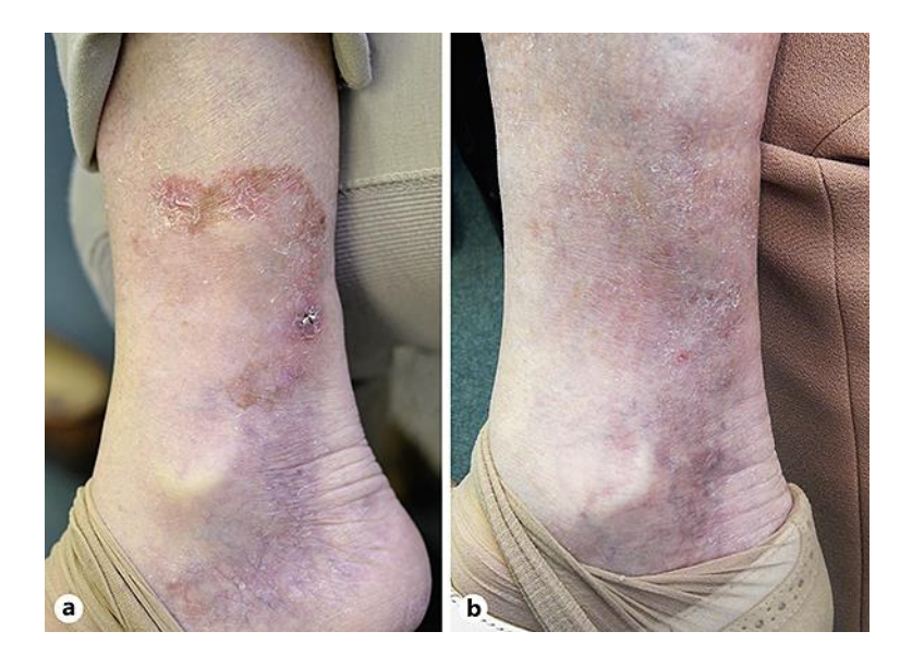
Fig. 1. a Invasive melanoma of the right medial lower leg before treatment. b No clinical evidence of residual melanoma after treatment with 5% topical imiquimod.