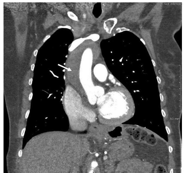
Figure 2 A computed tomography angiogram demonstrated a type A aortic dissection extending from the aortic root and involving the entire thoracic aorta (white arrow).

Although ablation-related complications involving the aorta are infrequent, they can have catastrophic consequences. Iatrogenic aortic dissection occurring during cardiac surgery or cardiac catheterization has a reported mortality rate of 35%. 5 Though early recognition of aortic dissection