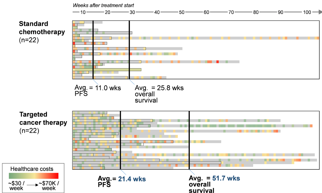
Figure 1: Overall survival and progression-free survival for patients receiving standard chemotherapy or targeted cancer therapy. Colored boxes indicate lower (green) or higher (red) charge events for each week of treatment. Gray scale areas reflect periods of time during which no charges were generated.

To determine the costs associated with the two treatment approaches, we performed a healthcare-related