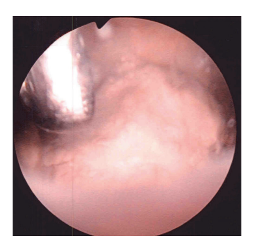
FIGURE 1: Endoscopic appearance of the tumor. Resectoscope reveals the tumor just before biopsy by forceps on TURBT.