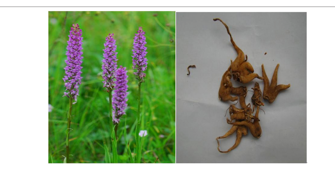
FIGURE 1 | Photographs of Gymnadenia conopsea (L.) R. Br. and the tuber.

been used as substitutes for G. conopsea in certain regions, such as Tibet region (Xie et al., 2005; Zi, 2008; Xue et al., 2009).