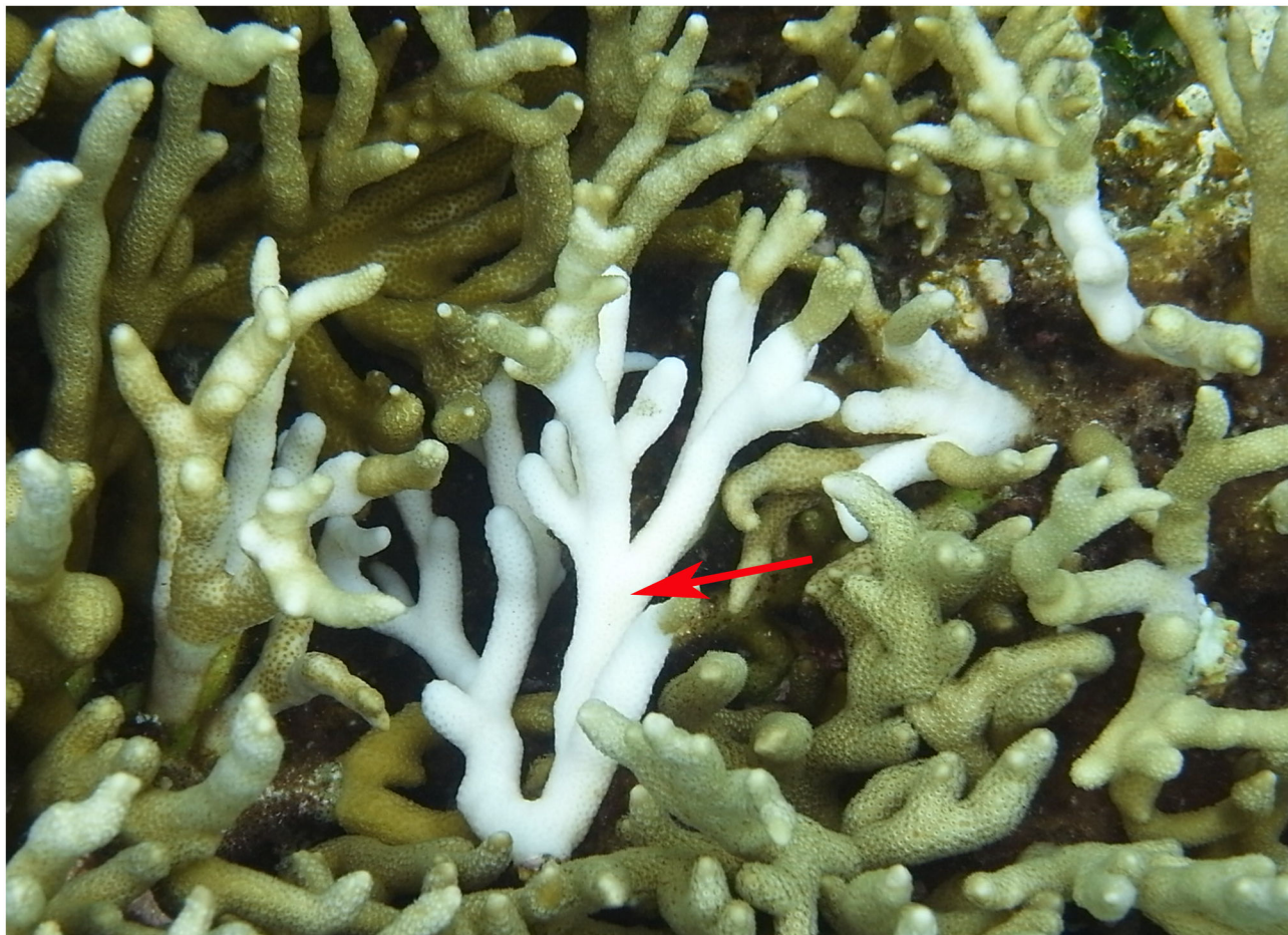
Figure 1. White syndrome of Porites andrewsi . Colony showing typical signs of PAWS at Nanshazhou Lagoon. The central colony (arrowed) exhibits severe tissue loss, where nearly the whole skeleton was denuded very recently (bright white). The size of the tissue loss area of the central individual was greater than those of surrounding individuals.