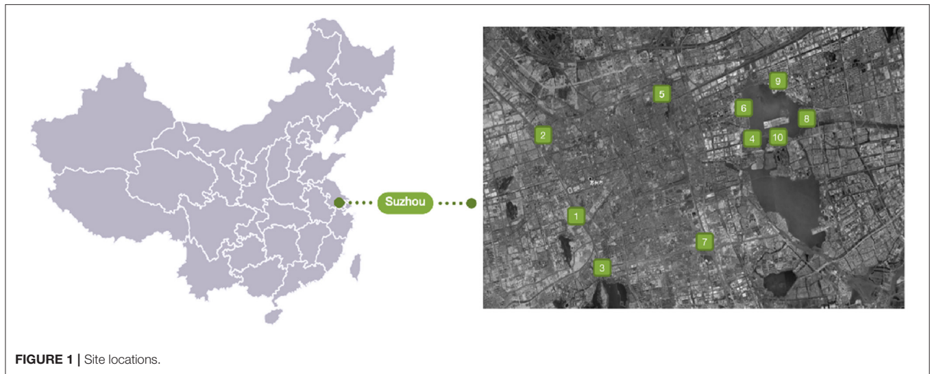
FIGURE 1 | Site locations.