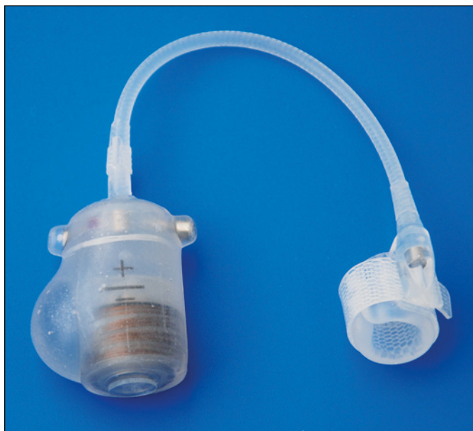
Figure 1. Artificial urinary sphincter ZSI 375.