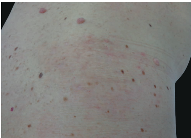
FIGURE 2: Clinical improvement after 4 months of topical corticotherapy

The diagnosis is based on the clinical suspicion and confirmation by histopathology. The histopathology reveals mature ectopic adipocytes interspersed with collagen bundles and prolifer-