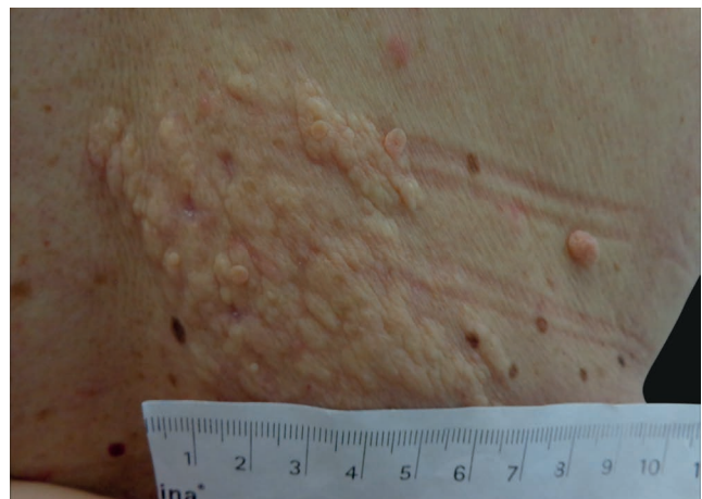
FIGURE 1: Subtly yellow plaque, made by multiple pedunculated and confluent papules on the right infrascapular region