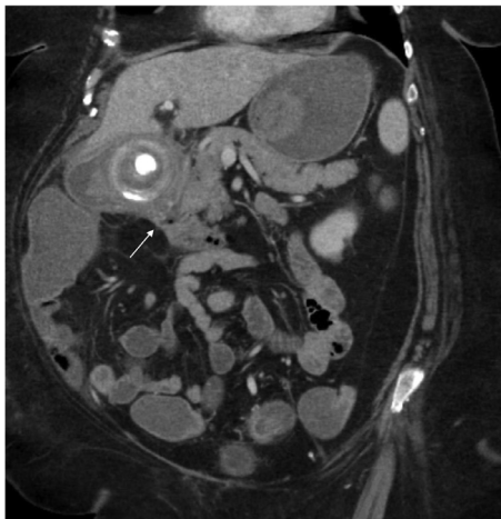
Fig. 2 – Computed Tomography (CT) image of the patient's abdomen from the coronal view. The biliary enteric fistula is indicated by the white arrow.

agnosis and allows for visualization of cholelithiasis, fistulas, air in the bile duct, and contraction of the gallbladder [1,3].