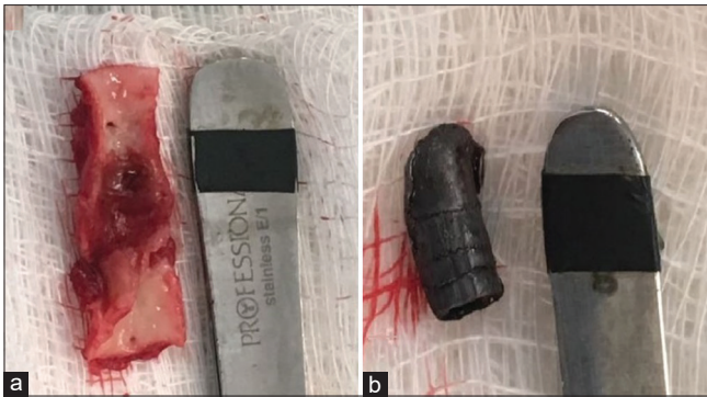
Figure 3: (a) Resected segment of the right brachial artery injured by bullet embolism. (b) Bullet fragment retrieved from the right brachial artery corresponding to 5.6 mm × 15 mm R ammunition

arteriography showed no aorta or abdominal vessels lesions. Small fragment immediately migrated to mesenteric artery branches, and the larger bullet piece migrated 10 days after initial trauma to the right brachial artery. Unfortunately, it was not possible to perform angiography image of the abdominal vessels once exploratory laparotomy was already indicated due to the portal vein gas. Postlaparotomy arteriography was performed only when signs and symptoms showed that it was relevant for patient management. The diagnosis of this rare entity was made with surgery findings and trauma mechanism. There was no abdominal perforation, hemoperitoneum, organ injury, or clinical history that would justified intestinal ischemia.