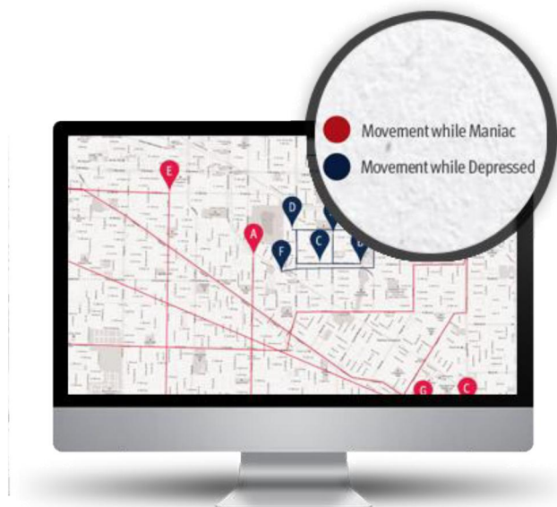
FIGURE 1 Ecological momentary assessment of bipolar disorder (BD) symptoms

the onset of BD mood episodes (see https://vimeo.com/72778974 ) and problematic behaviors (e.g., reckless spending).