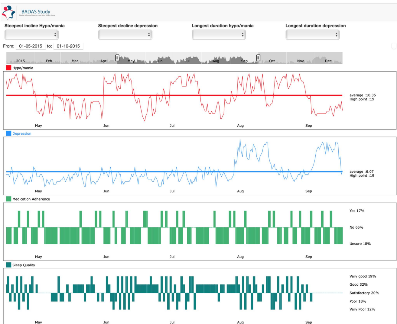
FIGURE 3 Bipolar disorder (BD) self-care website (example), compiling daily app responses

As implied above, we did not expect a significant percentage of BADAS participants to donate accumulated funds to charity. This suggests varied motivation to participate in mental health research. Future research is required to address motivation to participate in longitudinal research. We noted that BADAS participants were