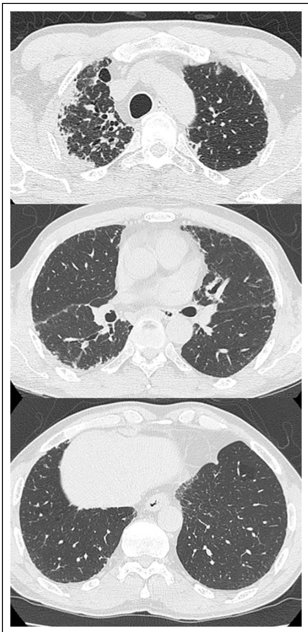
Figure 2. Representative chest CT scans of a PPFE patient (45-year-old man) showing subpleural airspace consolidation and reticular opacities predominantly in the upper lung lobes. PPFE: pleuroparenchymal fibroelastosis; CT: computed tomography.

complicated imaging findings and histology patterns. In the lower lungs, there are borderline patterns difficult to classify as simply UIP or PPFE on CT and histology specimens. 51 Based on our observations over the years, we suspect that the progression of PPFE in the lower lungs largely depends on newly developed chronic fibrosing IP, UIP, or non-UIP,