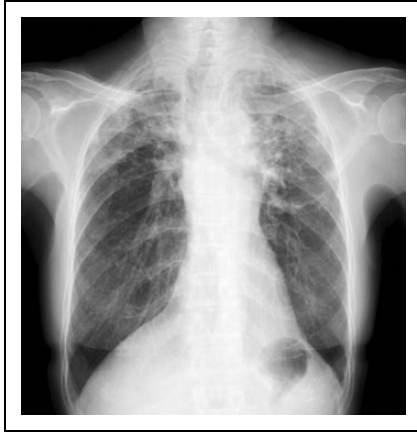
Figure 1. Representative chest radiograph of a PPFE patient (56-year-old woman) showing reticular opacities in the bilateral upper lung fields and the elevation of bilateral hilar opacities with a rightward deviation of the trachea. PPFE: pleuroparenchymal fibroelastosis.

A lateral view demonstrates an abnormally narrowed anterior–posterior thoracic dimension due to a flattened thoracic cage in PPFE (Table 4).