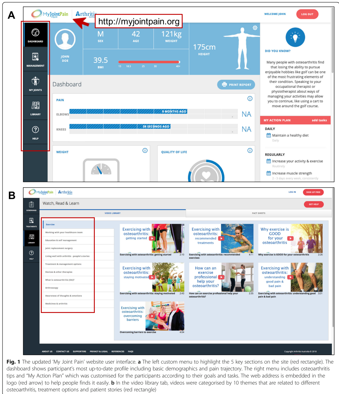
Fig. 1 The updated 'My Joint Pain' website user interface. a The left custom menu to highlight the 5 key sections on the site (red rectangle). The dashboard shows participant's most up-to-date profile including basic demographics and pain trajectory. The right menu includes osteoarthritis tips and "My Action Plan" which was customised for the participants according to their goals and tasks. The web address is embedded in the logo (red arrow) to help people find it easily. b In the video library tab, videos were categorised by 10 themes that are related to different osteoarthritis, treatment options and patient stories (red rectangle)

item on weight management). Each QI was considered eligible if the participant checked "Yes" or "No". QI pass rates were tabulated as a percentage of "Yes" responses out of the total number of eligible responses. The changes in OAQI from the baseline to follow-up were categorised to as negative change, no change, or positive