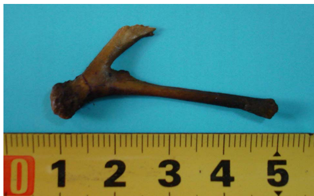
Figure 2 Extracted chicken wishbone from ileum.

The HP diagnosis revealed that a macroscopic and histological feature of examined samples responds to Ileitis