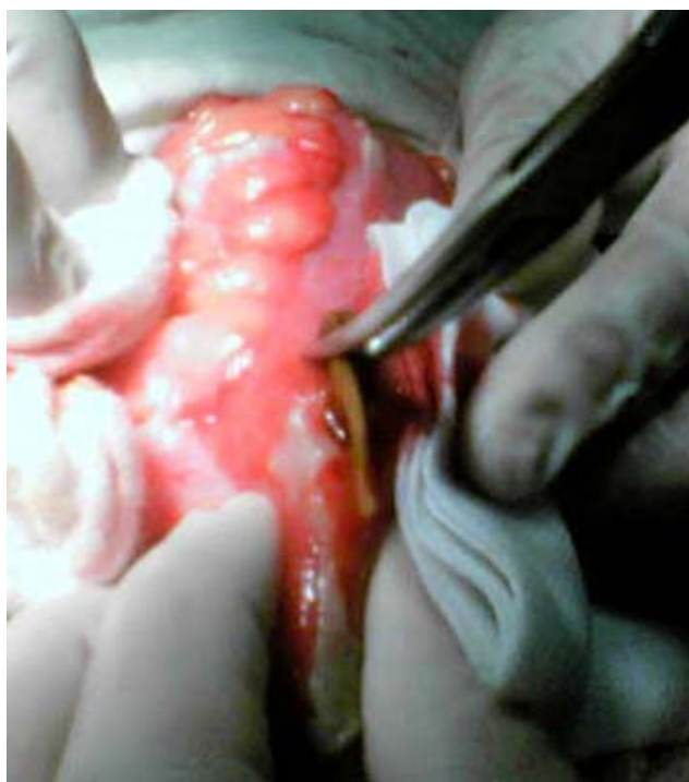
Figure 1 Intra operative finding of perforated ileum with chicken wishbone.

Laparotomy was performed in general anesthesia on the day the patient was admitted. Intra operative findings revealed diffuse fibro purulent peritonitis with adhesions between small bowels; and about 40 cm from Bauchini valve the presence of a sharp chicken wishbone perforated the ileum at the ante mesenteric site (Figure 1). The wall of that part of the ileum was thick and succulent. The patient was treated after the adhesiolysis with resection of