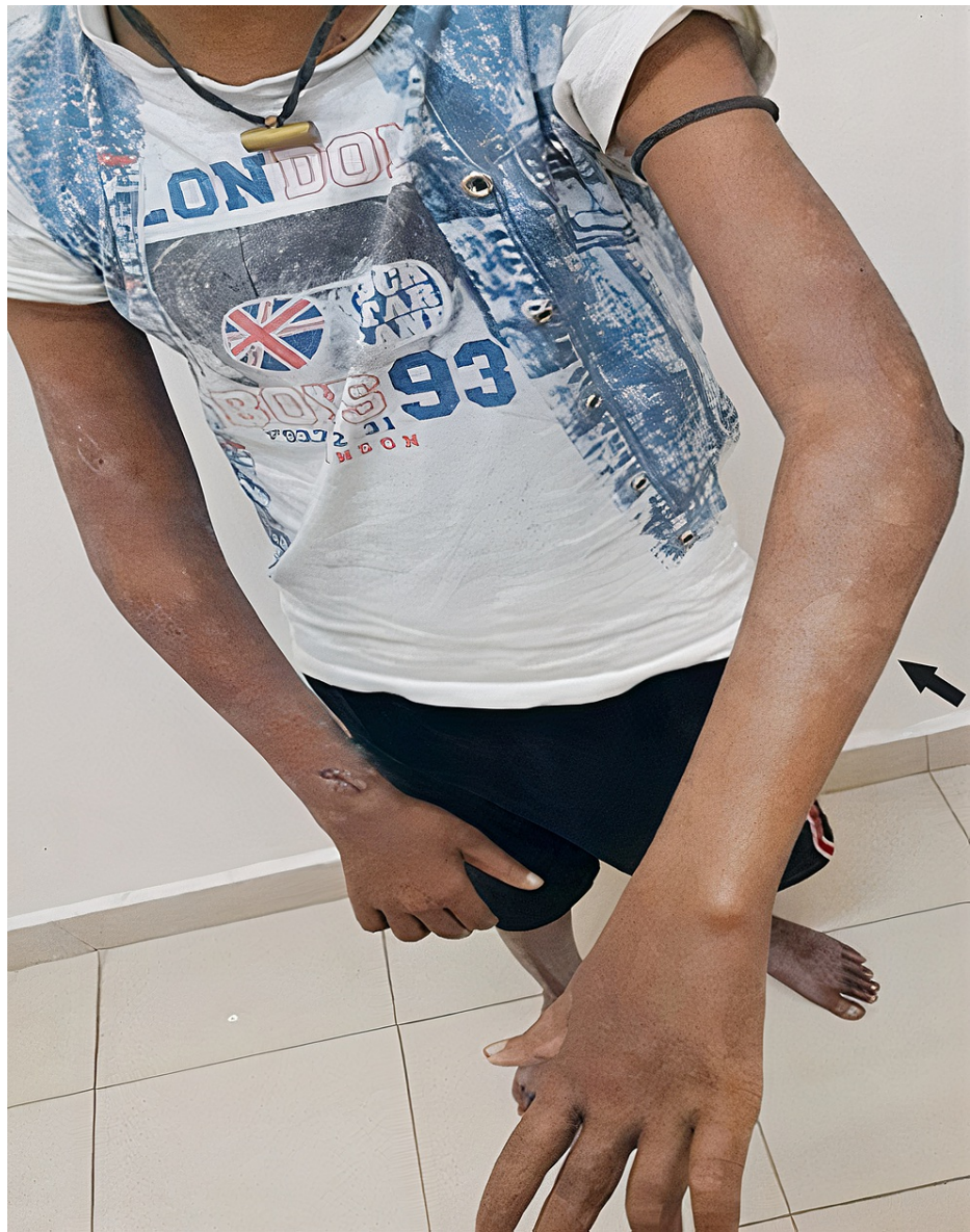
FIGURE 1: Multiple hypopigmented hypoesthetic macules noted on the extensor surfaces of upper limbs.