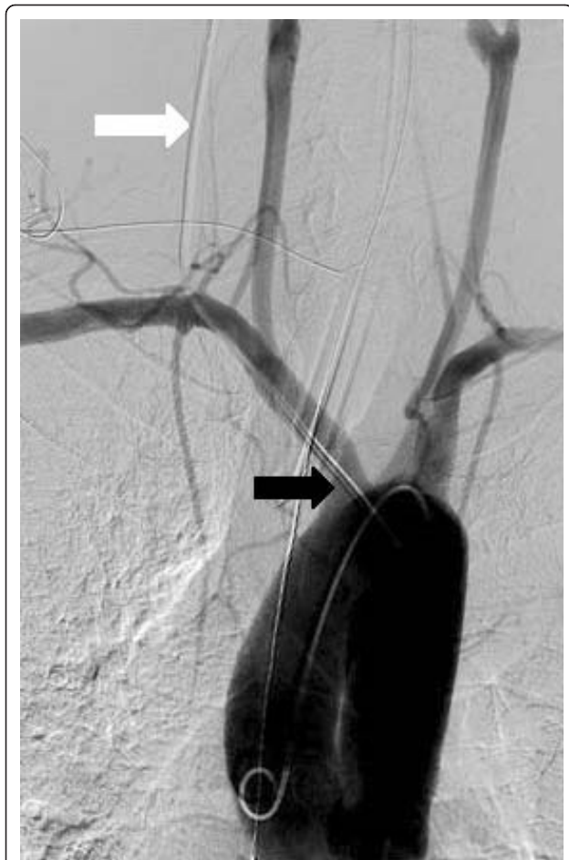
Figure 1 Angiogram of the aortic arch in Case 1 showing a misplaced central venous catheter (white arrow) entering the arterial system beyond the origin of the right vertebral artery. The tip of the catheter is in the aortic arch (black arrow).

could lead to uncontrollable bleeding, without the ability to directly compress the arterial puncture. The surgical procedure was postponed.