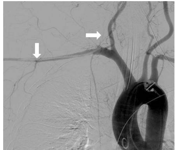
Figure 4 Angiogram of the aortic arch in Case 2 showing a misplaced central venous catheter in the right subclavian artery (arrows).