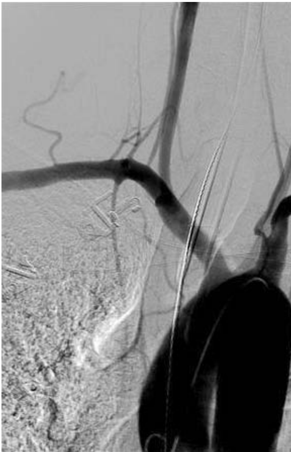
Figure 3 Angiogram of the aortic arch in Case 1 after insertion of a closure device, showing no contrast extravasation or vessel narrowing.

The arterial injury in Case 1 could have been caused by a needle inserted too far and too low, transversing the IJV and entering an artery, or by a stiff dilator. Despite a properly placed guidewire, a stiff vascular dilator may go over the soft wire and through the vein wall, causing injury to the adjacent artery. This illustrates two important practical points. First, an IJV puncture should be made closer to the apex of the two heads of the sternocleidomastoid muscle. Second, the dilator should be used to dilate skin and subcutaneous tissue rather than the wall of a vein.