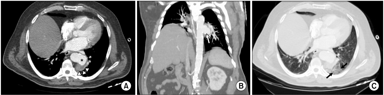
Fig. 1. Contrast-enhanced multidetector computed tomography showing (A) a saccular aneurysm (asterisk) and perianeurysmal atelectasis (arrowheads), (B) favorable position of the aneurysm in reformatted coronal oblique multiplanar reconstruction (arrow), and (C) the presence of ground-glass opacities (arrows).