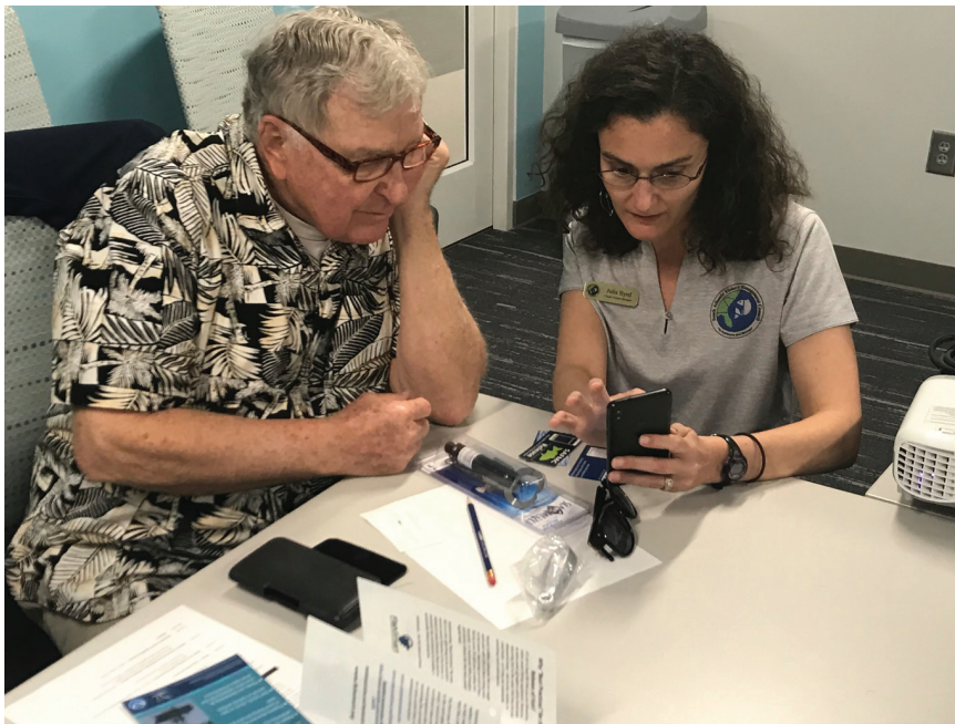
Figure 4. SAFMC Citizen Science Program staff training a fisher to use the SAFMC Release app.

The team drew from members of each of the A-Teams including fishers. They kept at the forefront the goal that project data should contribute to the forthcoming stock assessment. This goal is intended to account not only for the scientific utility of the data, but also for the trust that fishers are placing in the project as a worthwhile investment of their time. Fishers also were critical to the design of the app, contributing insights such as the fact that geolocation features run down data and batteries, that the app must be operational one handed, and that it would be critical for the app to be useful once back at the dock.