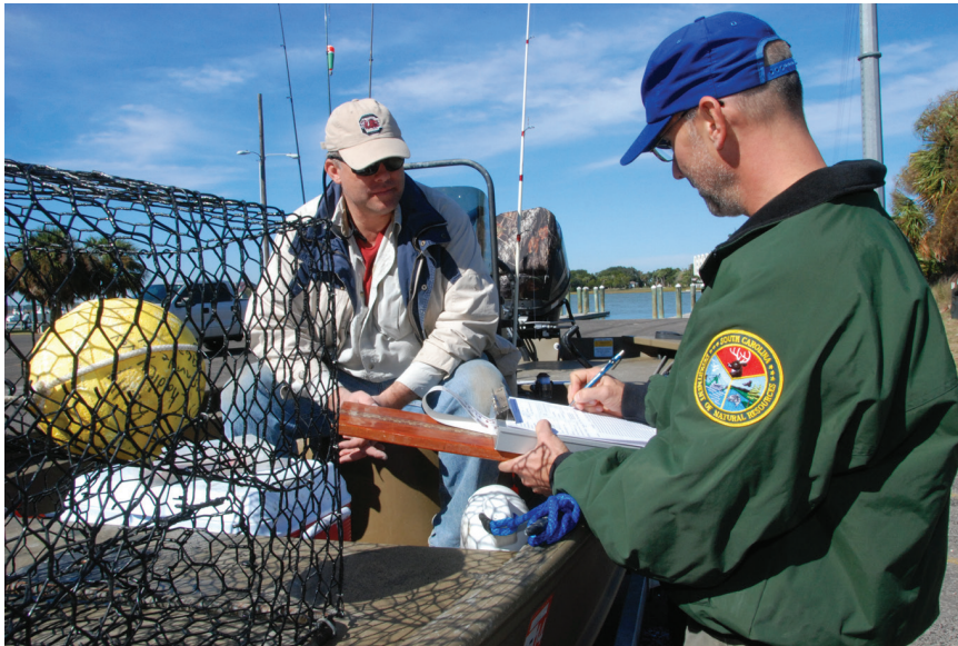
Figure 1. South Carolina Department of Natural Resources fisheries biologist conducting creel survey with recreational fisher. Such surveys can provide data useful in assessing catch.