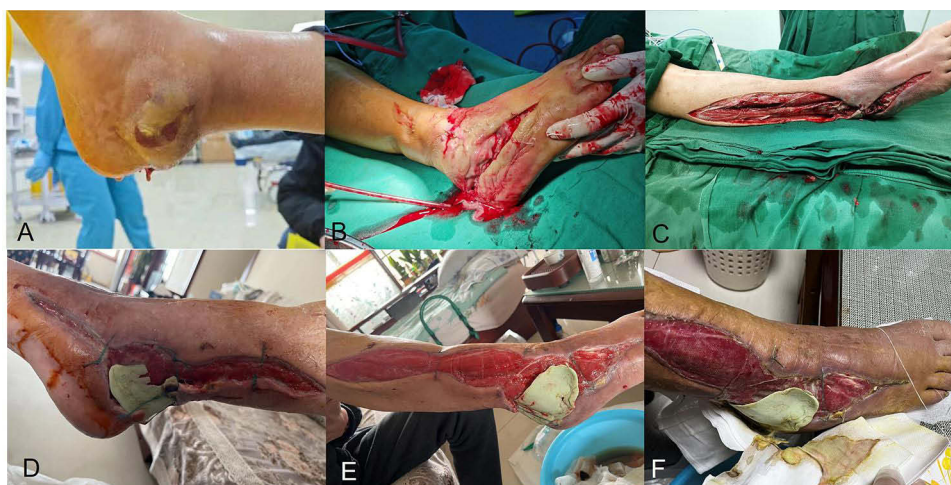
Figure 2 A 70-year-old male with a diabetes history for 10 years, had his right ankle sprained 2 weeks ago, no fracture, with local plaster immobilization. Ten days afterwards, he had redness, pain and swelling at the affected site, with no specific treatment. One day ago, spontaneous ulceration and pus flow presented (A) and he presented at emergency department of our institution, mentally languid, with a fever. Emergent surgery was performed for fasciotomy and removal of the necrotic tissues (B and C), and culture of wound specimens confirmed \beta -hemolytic Streptococcus . Systemic toxic symptoms disappeared several days after, and the patient wound bed became better ((D and E), day 20; F, day 30).

NLR/PLR in relation to adverse outcomes (morbidity and mortality) has been studied repeatedly in a variety of settings, including cancer, chronic/acute medical conditions or trauma. 7,10,11,16,17 However, specifying at NF, there were only two studies evaluating the utility of NLR/PLR: Ravindhran et al 18 suggested that a preoperative NLR of >7.5 , but not PLR, significantly increased the risk of morbidity/mortality, and Johnson et al 26 found a moderate correlation of NLR with in-hospital mortality, which could be further improved by evaluating the ratio of NLR to platelet count. Our findings showed that both NLR and PLR were independently associated with mortality in patients with NF, confirming this relationship. The mechanism underlying the association of elevated NLR/PLR with mortality not entirely clear, but was largely attributable to severe underlying inflammatory process caused by triggered release of arachidonic acid metabolites