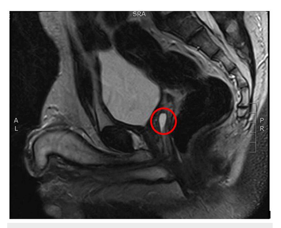
FIGURE 1: MRI abdomen and pelvis (red circle shows Mullerian duct remnant).

MRI abdomen and pelvis were performed which revealed Mullerian duct remnants (Figure 1). Testis were visible bilaterally in scrotum but were smaller in size.