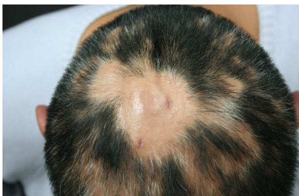
Fig. 1. The skin on the scalp shows parallel vertical folds and furrows. Hair appears multiple bald patches on the scalp.

As for the histopathological findings, normal primary findings can be obtained, however, the thickening of the collagen fiber, hyperplasia of the pilar cyst, and sebaceous glands are also observed. 7 In our present case, a slight increase of collagen and hyperplasia in the piloerector muscle was observed, while lymphocytic peribulbar infiltration was observed in alopecia areata lesions.