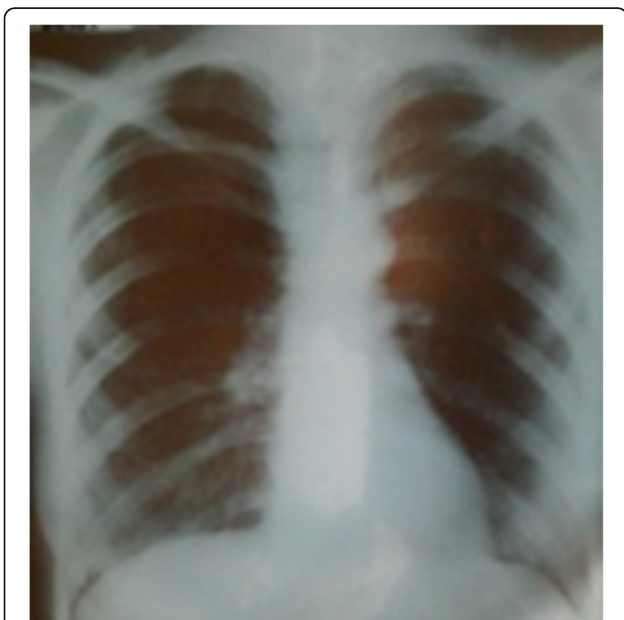
Fig. 1 Chest X ray Adenitis hilly bill

Abdominal paracentesis was performed and revealed clear exudative fluid with benign cells. In consultation with gynecologist, the patient underwent operation, suprapubic transversal laparotomy. During operation, in the left tubo-ovarial complex was found caseose mass which was sent together with samples from omentum, peritoneum and ascites for histopathology and microbiological examination. On histopathological examination were seen epitelioidal granulomas with gigantic multinuclear cells, lymphocyte infiltrations and caseous necrosis. On Lowenstein-Jensen cultures was isolated Mycobacterium tuberculosis sensitive to Rifampicin (RIF), Isoniazid (INH), Ethambutol (ETH) and Streptomycin (STM). The patient was treated with a 4-drug TB treatment regimen consisting of RIF, INZ, Pyrazinamide, and ETH