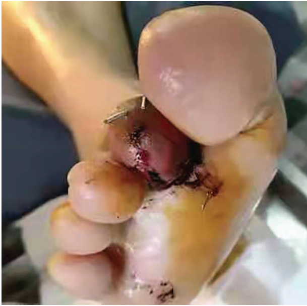
Figure 6. Postoperative appearance of donor toe.

removed, and passive movement of the thumb was enhanced (Figs. 5 and 6). Further rehabilitation was undertaken in a rehabilitation hospital after the removal of the kirschner wires 2 months after the operation (Figs. 7 and 8). Three months after surgery, x-rays showed bony healing. Four months after the second surgery, the VAS score was 0. No complications were observed (eg, osteomyelitis, osteolysis, osteoarthritis, and nonunion of artificial dermis), but there was still mild sensory disturbance in the thumb, and the mobility of the metacarpophalangeal and IPJs of the thumb was 0 to 60° and 0 to 40°, respectively, which were 100% and 60% of the mobility of the