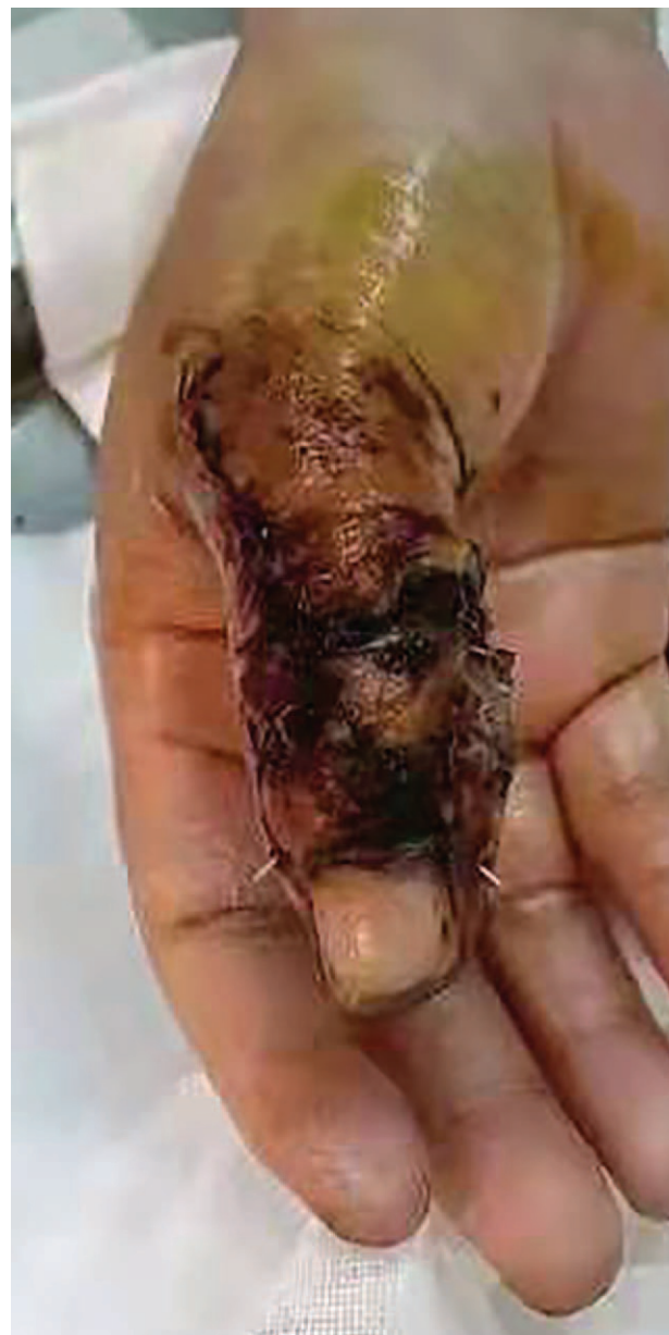
Figure 5. Postoperative appearance of the affected finger.

artery, and finger artery were then anastomosed end-to-end under the microscope. After loosening the tourniquet, good blood flow was observed. After rinsing the wound, a skin defect of approximately 8 \times 6 mm was observed on the dorsal side of the thumb, which was covered with artificial dermal material trimmed to the appropriate size. Finally, the wound was intermittently sutured and dressed (Fig. 4). Postoperative treatment included anti-infection, anticoagulation, anti-vascular spasm, swelling and pain relief, dressing changes, and external fixation of the hand in a plaster cast for two weeks, as well as appropriate postoperative elevation of the affected limb, wearing elastic stockings for two days, and prohibiting the foot from going to the ground for two weeks. One week postoperatively, the thumb metacarpophalangeal joint and wrist joint were given appropriate passive movement, and 15 days postoperatively, the silicone layer on the surface of the artificial dermis was