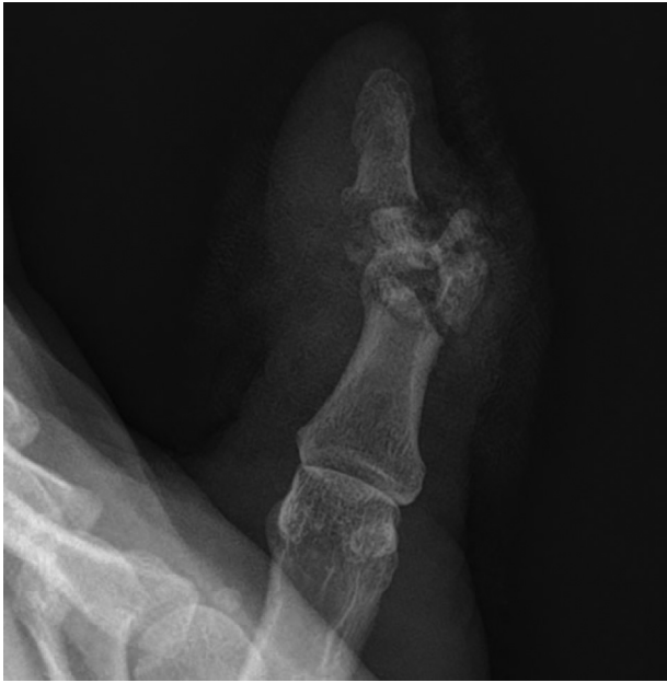
Figure 1. Preoperative oblique x-ray of the affected finger.

admitted a case of thumb interphalangeal joint (IPJ) reconstruction using the proximal IPJ of the 2nd toe combined with a double layer of artificial dermal after a severe crush injury to the IPJ of the right thumb, with good results, which are reported below. The patient provided informed consent for publication of the case.