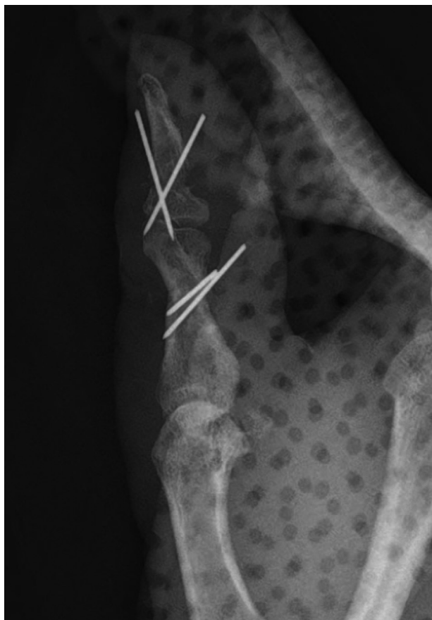
Figure 4. Postoperative x-ray of the affected finger.