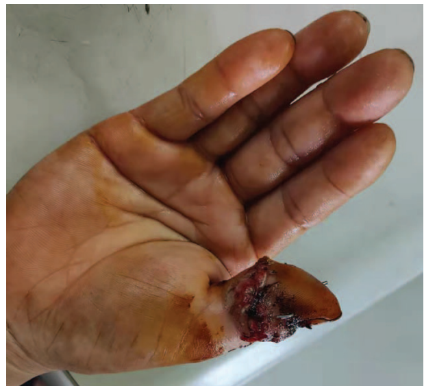
Figure 3. The appearance of the affected finger before the second surgery.