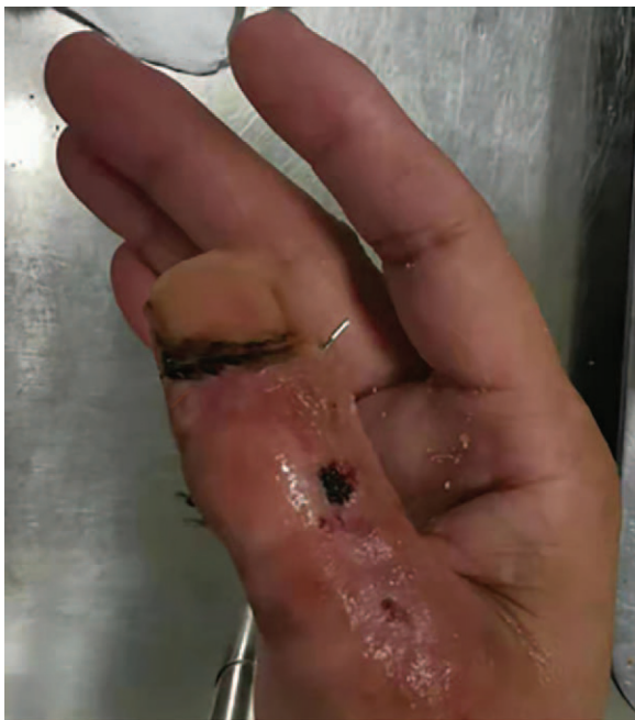
Figure 7. The appearance of the affected finger 2 months after surgery.

Metal, silicone, and coke are presently used as implants for the reconstruction of the IPJ of the finger. The use of a composite flap of the toe joint combined with artificial dermis covering to