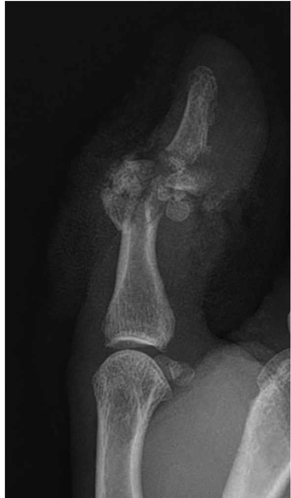
Figure 2. Preoperative x-ray of the affected finger.

Surgery was performed under brachial plexus and lumbar anaesthesia. Surgery was performed under tourniquet control. Surgical design: According to preoperative radiographic measurements, the patient's thumb joint defect was 18 mm in length and 7 mm in width. On the basis of this measurement, a flap was