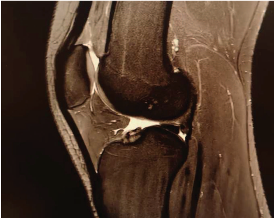
Figure 4. MRI image of the 19-yr-old female karateka; no pathological changes of the tibial tuberosity and ligaments are observed.