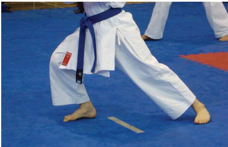
Figure 2. Asymmetric lower limb loading (60% on the front leg; 40% on the rear leg) with the example of the analyzed female athlete (10 yrs old).

tournaments of international rank. The training load was distributed over 2 periods: the preparation period and the competitive period. The preparation period lasted 3 months, with the athlete performing 6 to 10 specialized training sessions per week at a lower intensity compared to the competitive period and with a higher volume of up to 3 hours per session. The competitive period lasted 7 months and included 6 to 8 specialized training sessions per week, with a significant volume of 2 to 3 hours per session. The training sessions took place in a gym equipped with a mat for practicing martial arts. However, for 6 years, in the first period of sports training, the athlete trained barefoot on a hard and non-cushioned surface (wood flooring). The technical specificity of the sport forces the asymmetric distribution of the athlete's body weight, with 60% resting on 1 lower limb flexed at the knee joint, and 40% resting on the other lower limb (Fig. 2).