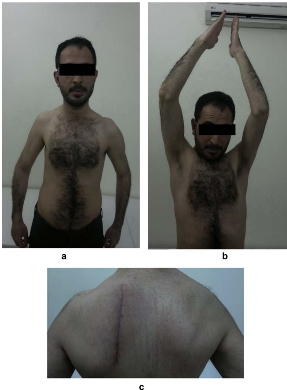
Fig. 3. (a) Improvement of neck- shoulder appearance, (b) shoulder ROM in abduction, (c) surgical scar 6 months after surgery in the patient presented in figure 1.

common mechanism (9 of 11) of spinal accessory nerve injury among these patients was biopsy of the lymph node of the neck. The mean age of the patients was 41 years (range: 25 to 59). The mean follow-up period was 33.5 months (range: 24–48 months) (Table 1). The mean interval between the nerve injury and surgery was 10.18 months (range: 7–18 months). The mean pre-operative VAS score was 7, while it was 1.6 after surgery ( p -value < 0.05). The baseline pre-operative mean ASES score was 32.8, which improved to mean ASES score of 82.1 at the final visit ( p -value < 0.05). The mean preoperative range of motion in forward elevation and abduction were 121.80 and 80.00° and increased significantly to 154.40 and 148.18°, respectively ( p -value < 0.05) (Table 2) (Fig. 3a–c).