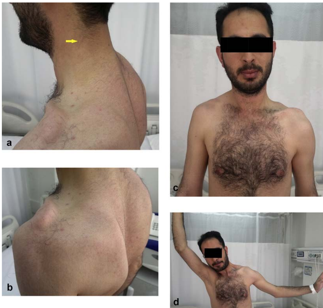
Fig. 1. (a) Photograph shows previous site of biopsy from cervical lymph node, (b, c) atrophy of trapezius muscle, (d) Limited range of motion in abduction.

The levator scapula muscle advanced laterally and attached to the scapular spine with two Krackow suture using heavy non-absorbable sutures. Similarly, both rhomboid muscles were attached to the infraspinatus fossa (Fig. 2c). Caution was made to keep bone-to-bone contact between the fragment and the scapular bone for better healing. The wound was closed in layers and dressed.