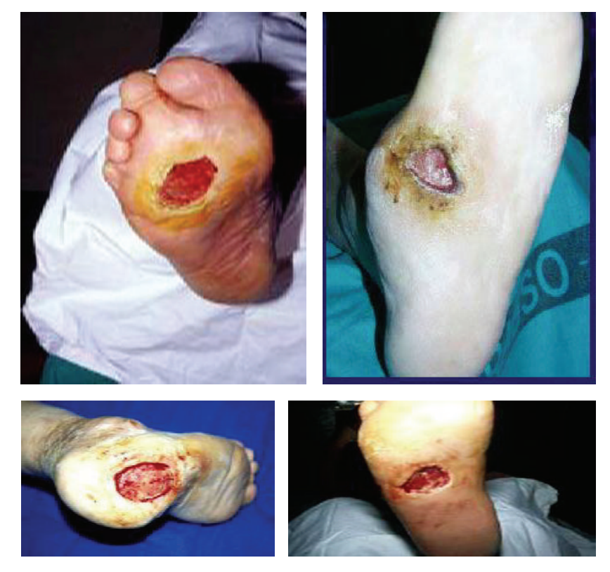
FIGURE 2: Neuropathic ulcers.