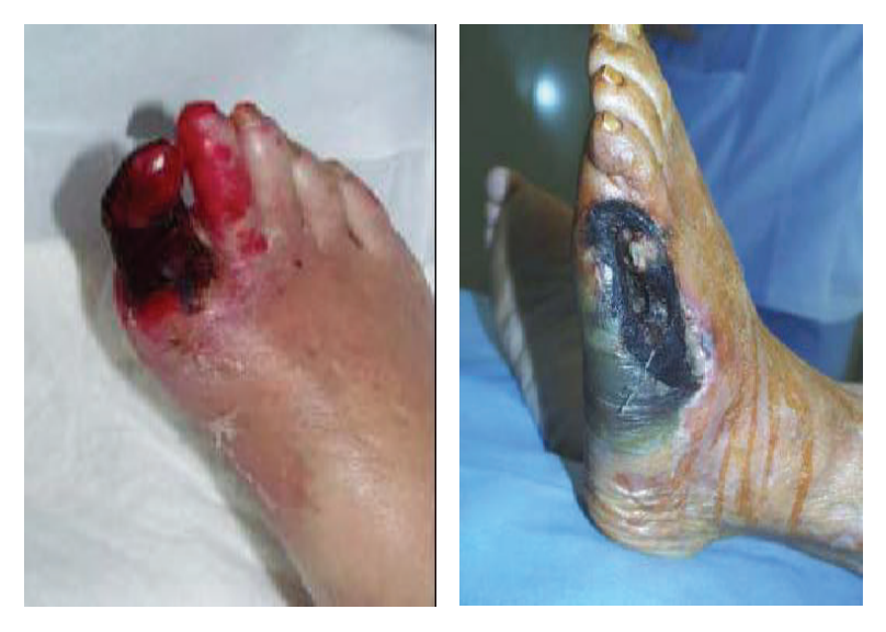
FIGURE 4: Infected diabetic foot.

ischemic stroke) and on a prospective evaluation (new onset TIA and stroke on a 5-year follow-up). The most prevalent subtypes of stroke were lacunar and LAAS subtype with a slight higher prevalence of the lacunar subtype and this finding could suggest a role of both microvascular disease and atherosclerotic macroangiopathies, a determinant of vascular morbidity in patients with diabetic foot. The higher cardiovascular risk associated with diabetic foot may be related to a cumulative effect of the single risk factor linked to neuropathy and PAD, which are two well-known medical conditions recently associated with increased cardiovascular morbidity [18, 19], but another explanation could be recognized in the role of microangiopathy as a determinant of overall vascular risk. Nevertheless, because the groups evaluated in this study did not start with balanced CV risk factors and CV disease, authors cannot exactly correct for so many other powerful indicators especially with small numbers and relatively few