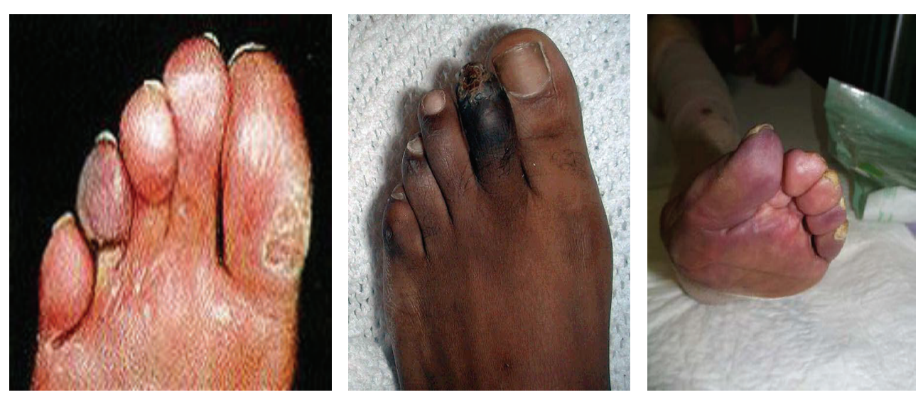
FIGURE 3: Ischemic diabetic foot.