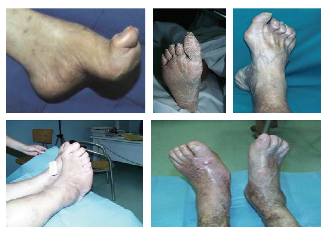
FIGURE 1: Neuropathic diabetic foot.