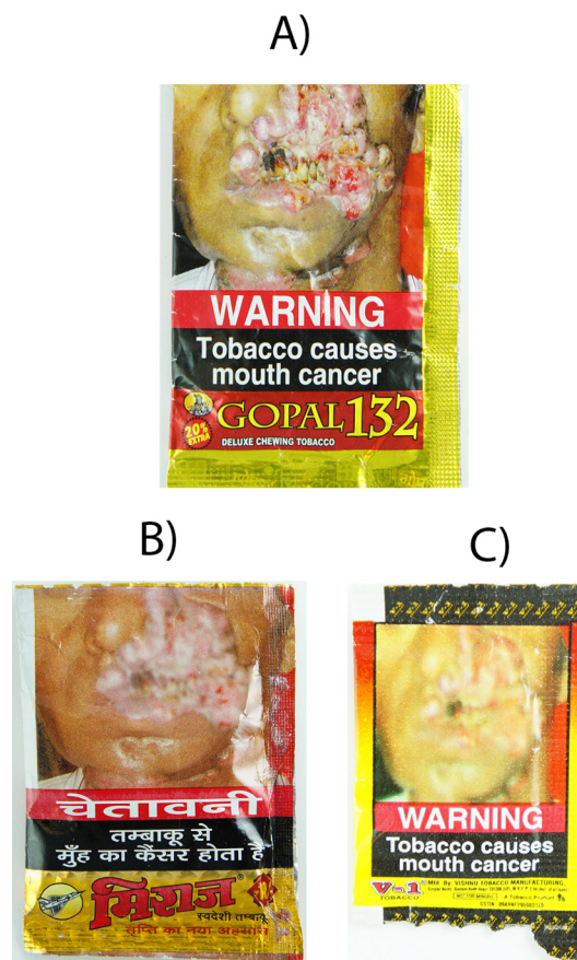
Figure 1 Smokeless tobacco products from rural India with differing health warning label (HWL) printing manipulations. (A) A HWL that is accurately printed, as prescribed by India law; (B) a HWL where the mouth cancer is selectively blurred, maintaining visual clarity for the remaining parts of the HWL; and (C) a HWL that is completely blurred, with sharp text and branding, suggesting these tobacco manufacturers have the ability to print clear packaging.

Although the Indian law exceeds many of the HWL guidelines in the WHO-FCTC, this deficit in effectual implementation diminishes the ability of HWLs to communicate the health risks of SLT products. We identified a need for regular monitoring of HWLs for accurate printing, with fidelity to the Ministry of Health and Family Welfare