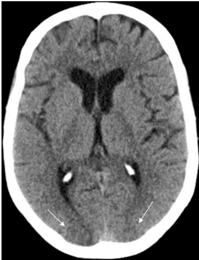
Figure 1 The axial native CT scan of the brain 4 days after hospitalisation showed relatively symmetrical bi-occipital patchy hypodense areas in the territories of the posterior circulation, cortical and subcortical, predominantly right sided.