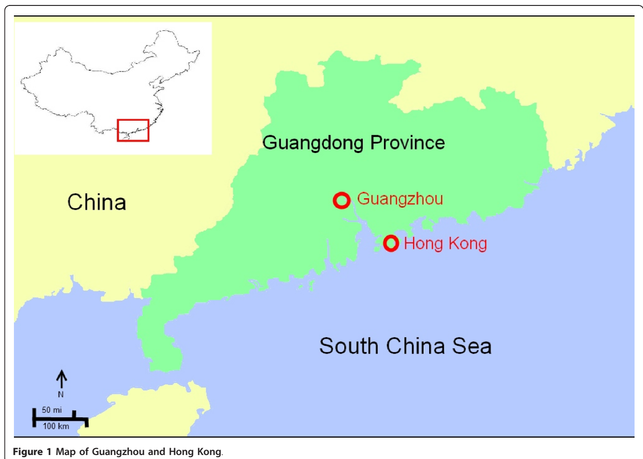
Figure 1 Map of Guangzhou and Hong Kong.

Mortality data for the period of 2004-2006 were obtained from the Hong Kong Census and Statistics Department and the Guangzhou Department of Health. According to Hong Kong Law all deaths from natural causes are required to be registered, so the mortality data in Hong Kong was fairly complete. The registered death data collected by the Guangzhou Department of Health covered the residents from the eight urban districts, but did not include the immigrant population and residents living in the two suburban districts. Therefore, the population denominator of Guangzhou did not change much during the study period. Given the fact that most immigrant workers are young adults and few