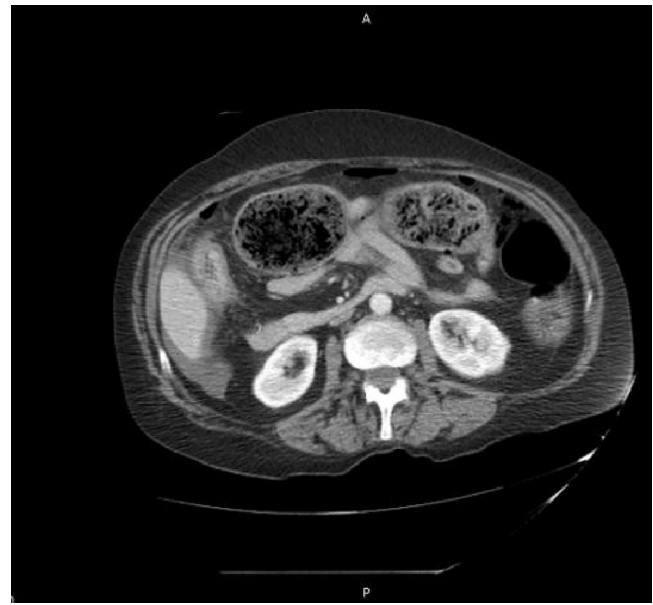
Fig. 2. Preoperative axial CT Abdomen showing small pockets of free gas at the anterior abdominal wall, colonic perforation and fecal impaction of the large bowel.

stable condition. Post-op diagnosis was intraabdominal abscesses and sepsis. After re-operation, she showed steady recovery with conservative treatment.