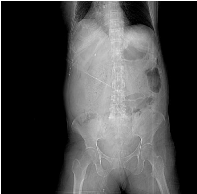
Fig. 1. Preoperative CT Abdomen/Pelvis showing significant amount of fecal matter within the pelvis.

revealed a partial hysterectomy, a cholecystectomy as well as an appendectomy.