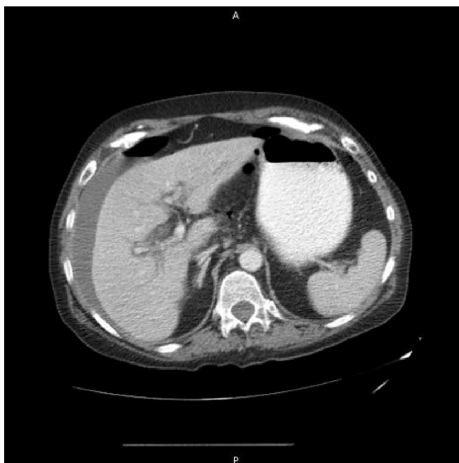
Fig. 3. Preoperative axial CT Abdomen showing spleen that was found to be ruptured during laparotomy.

ing opioid medications are at risk for this condition and should be monitored closely. Treating the constipation before a fecaloma can develop would eliminate the development of pressure necrosis caused by increased intraluminal pressure thus halting the incidence of stercoral perforation.