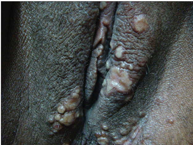
Figure 2: Vesicles and erosions in herpes genitalis

Most common cause of EM is infection, most commonly herpes simplex. M. pneumoniae is the most common cause in children. [54,55] Cutaneous lesions present typically as "target or iris" lesions. Mucosal lesions occur in 70% of cases, most commonly limited to the oral mucosa. Genitalia are rarely involved in EM. "Ectodermosis pluriorificialis" or "Fuchs syndrome" is characterized by severe