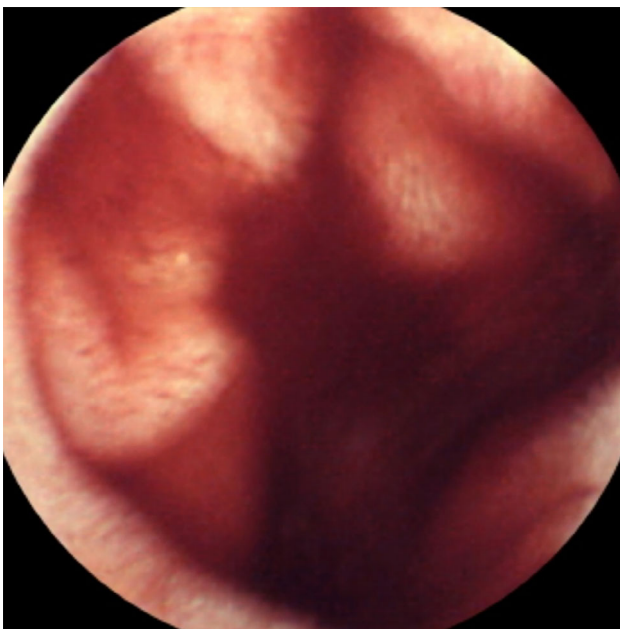
Figure 1 Video capsule endoscopy showing blush of blood in the proximal jejunum.

Small bowel carcinoma is rare compared with gastric and colorectal cancers. The small bowel constitutes 75% of the GI tract length and 90% of the mucosal surface area. However, only <2% of GI malignancies arise from the small intestine. 4,5 Small intestinal adenocarcinoma shows geographic variation. Specifically, it has low prevalence in Asia compared to North America, Northern Europe, or Oceania. 6 Males have a higher predisposition to these malignancies. Moreover, increasing age is associated with a higher incidence of such tumors. 1,4,5,7 The following are the most common histological types of small bowel cancers: adenocarcinomas (30–40%), carcinoid tumors (35–42%), lymphomas (15–20%), and sarcomas (10–15%). 7 Individuals with small bowel adenocarcinomas initially present nonspecific abdominal discomfort. As a consequence, the diagnosis is delayed and usually made in the context of an emergency involving an occlusion (40%) or bleeding (24%). 5,7 Additional nonspecific symptoms