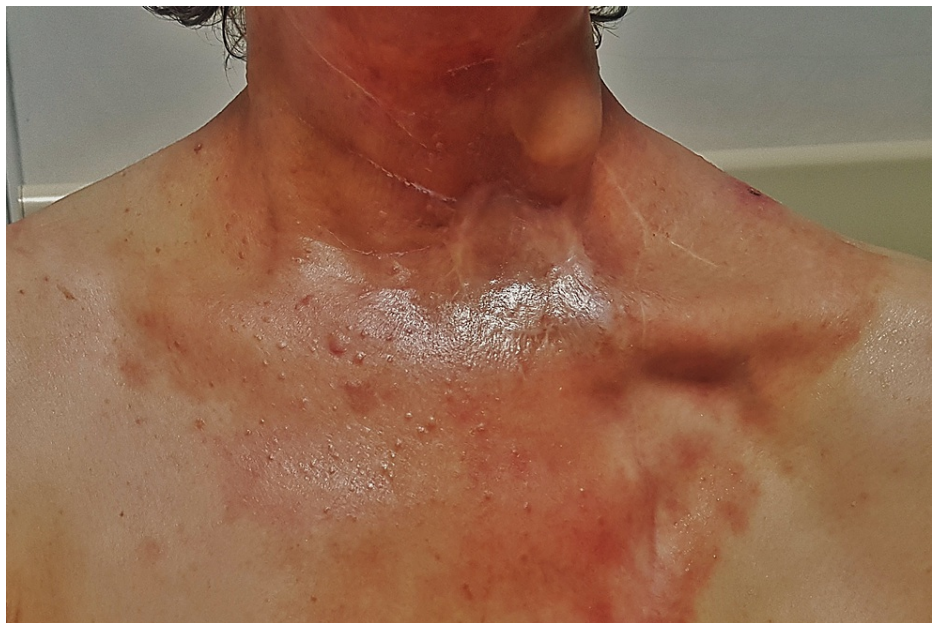
FIGURE 1: Erythematous plaque-like lesions after nivolumab administration.