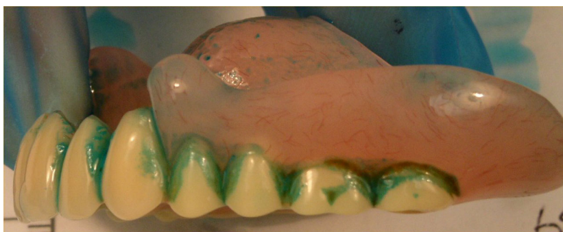
Figure 1 Example of a denture stained with plaque disclosure (blue), showing plaque accumulation on the upper fitting surface of the denture, and between the teeth of the prosthesis.