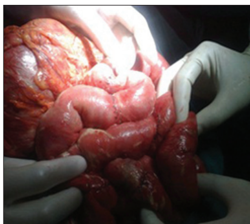
Figure 2: Multiple small bowel repairs

According to the pathology report, clinical signs and symptoms, and rheumatological consultation, PAN was a definite diagnosis and corticosteroid therapy (Methylprednisolone: 60 mg / day PO divided q 6 – 24