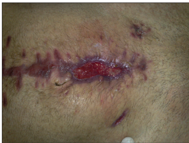
Figure 3: Patient's abdomen on forty-eighth day (discharge time)

In one study, Bourgarit and his colleagues described uncontrolled vasculitis and infection as being the major causes of early death in these patients. Despite