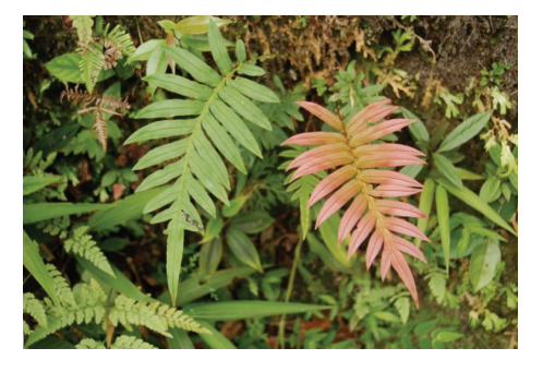
FIGURE 1: Photo of Blechnum orientale L. ( Kuan Chung in Chinese). The species was authenticated by Dr. Fa-guo Wang from Key Laboratory of Plant Resources Conservation and Sustainable Utilization, South China Botanical Garden, Chinese Academy of Sciences, Guangzhou, China. The species for this study was sampled in August 2010. The voucher specimen (voucher no. 01721757) has been kept in Chinese Virtual Herbarium, Chinese Academy of Sciences.

ferns have been consumed as edible plant and utilized as pharmaceutical species in China. The accumulation and/or the adsorption of toxic pollutants by medicinal ferns have not been intensively concerned up to date. The main objectives of this study were to (1) detect the degree to which B. orientale accumulated toxic metals and polycyclic aromatic hydrocarbons (PAHs) in a polluted environment and (2) investigate the transportation of heavy metals from roots to fronds of B. orientale .