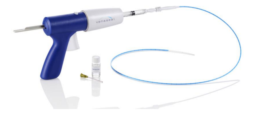
Figure 3. The VenaSeal cyanoacrylate delivery catheter.

(for VenaSeal) to prevent glue migration into the deep system. After every administration using ultrasonic visualization, the catheter is withdrawn, and prolonged manual pressure is applied. After the entire desired length of vein has been treated, the fiber and sheath are removed. Compression or wraps are not necessary.