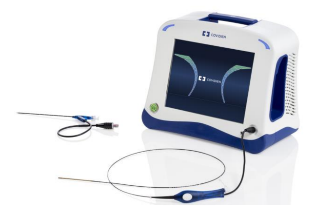
Figure 1. The ClosureFast radiofrequency ablation catheter.

contact with the heating element. It is important not to inject tumescent anesthetic directly into a vein as the aforementioned drugs will rapidly cycle into the cardiovascular system. Tumescent anesthesia must therefore always be administered under ultrasound guidance.