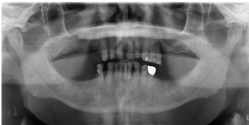
Figure 1. A panoramic radiograph shows bilateral linear soft tissue calcification in the cervical areas most consistent with calcified carotid atherosclerotic plaque. The inferior mandibular cortex represents the C2 Early stage of osteoporosis, showing semilunar defects with a normal cortical width by visual estimation.