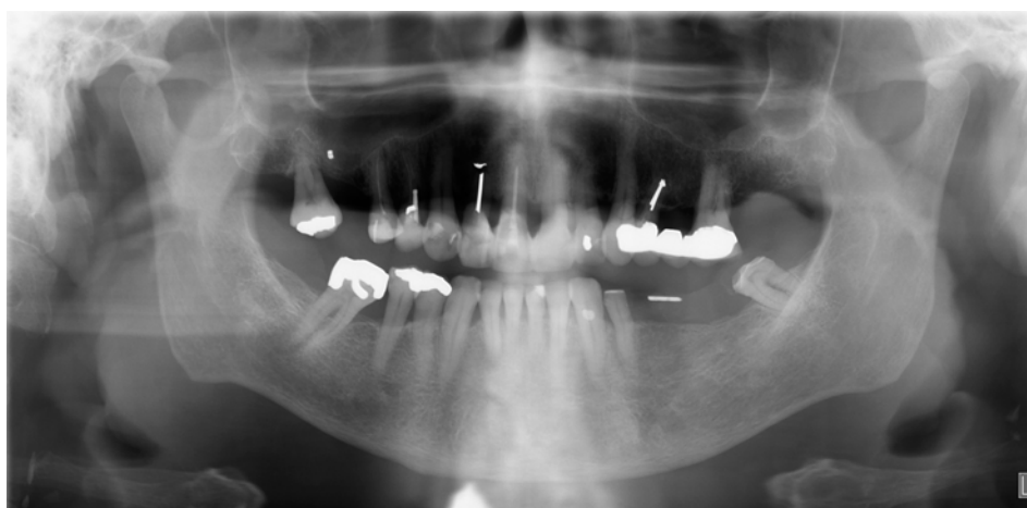
Figure 4. The inferior mandibular cortex on the given panoramic radiograph appears clearly porous (C3 Stage).

vers recording the same score, the same score recorded by the 2 observers was accepted as final. When all 3 observers were in non-agreement, a consensus was reached on a case-by-case basis. All of the radiographic assessments took place in a quiet room with subdued ambient lighting appropriate for radiographic viewing.