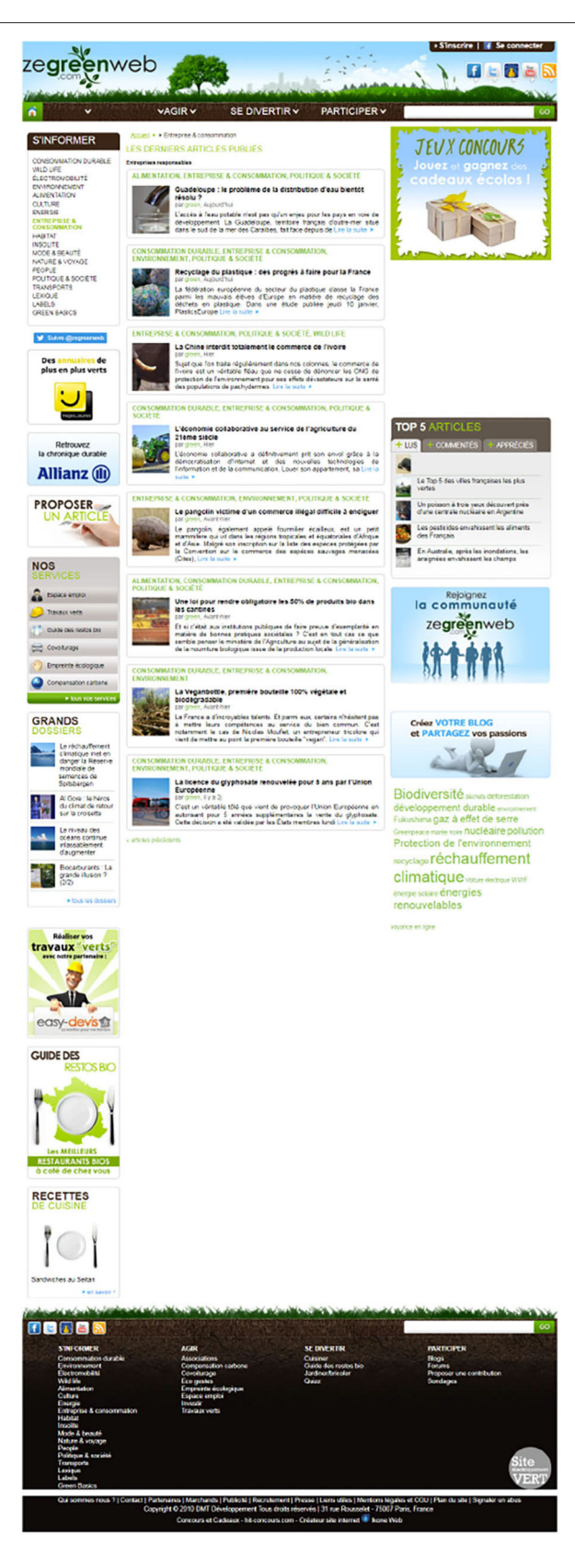
FIGURE 1 | Example of website displayed during the experiment.

number of targets available on the web page and their distribution across the page.